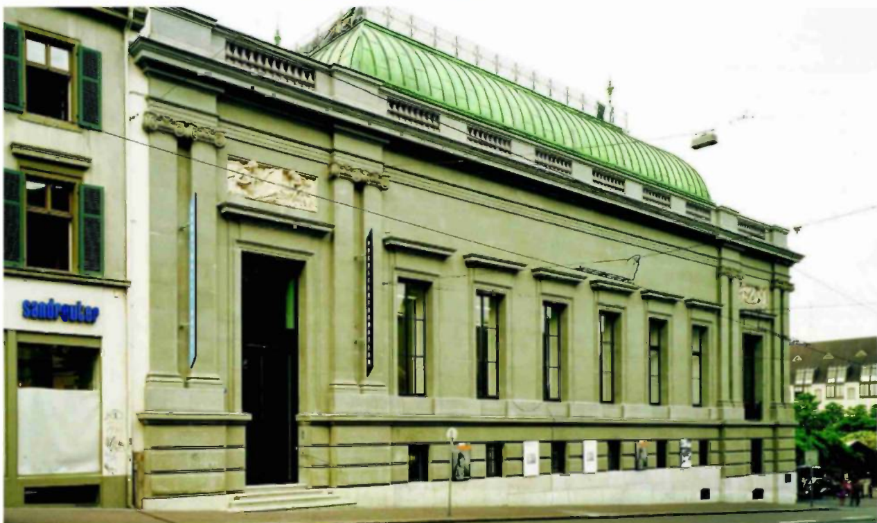
SERGE HASENBOHLER/KUNSTHALLE BASEL